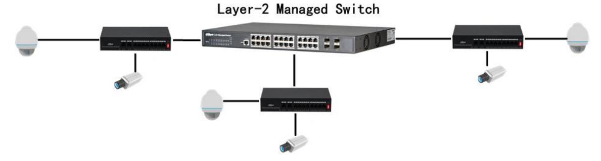
Figure 1-1 Typical networking scene