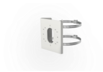
DS-1275ZJ-S-SUS Vertical Pole Mount